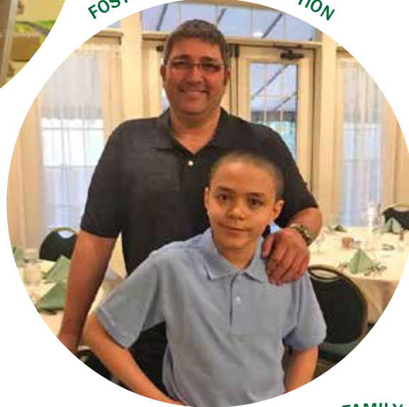
FOSTER CARE AND ADOPTION

Berkshire Children & Families BERKSHIRES • PIONEER VALLEY