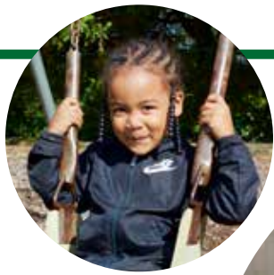
EARLY EDUCATION AND CARE